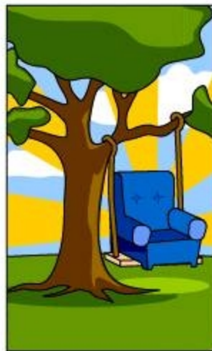
How the Business Consultant described it