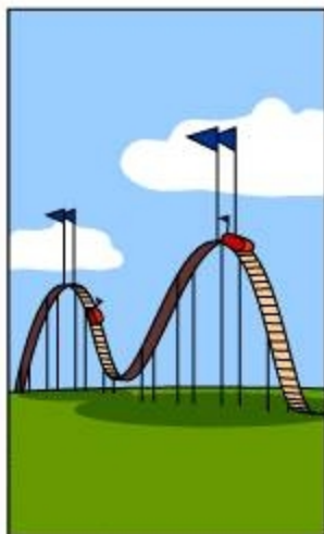
How the customer was billed