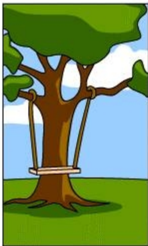
How the Project Leader understood it