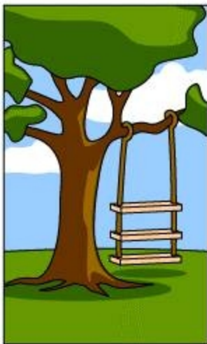
How the customer explained it