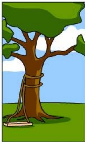
How the Programmer wrote it