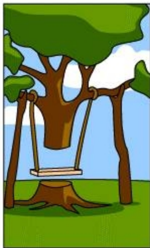
How the Analyst designed it