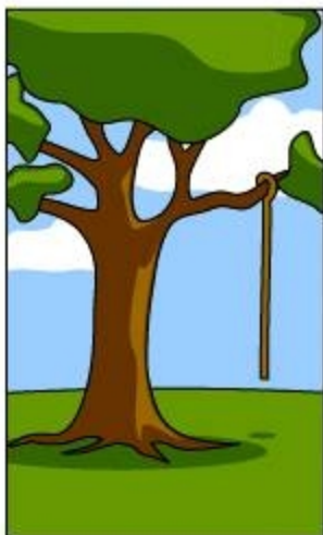
What operations installed