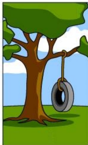
What the customer really needed