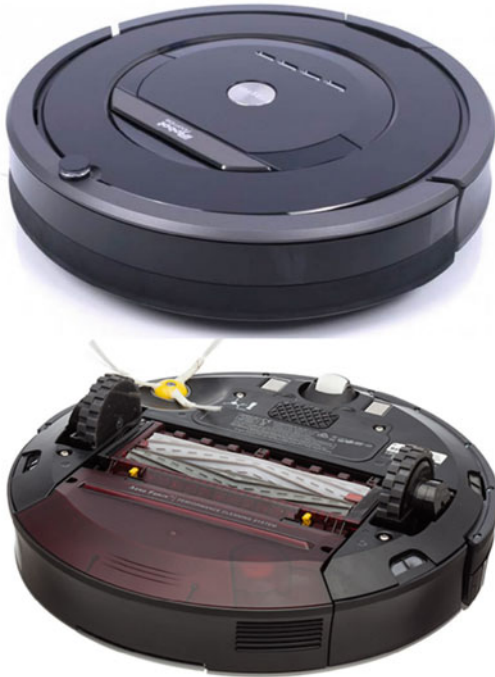
Wheeled Robots, Fig. 1 The Roomba (here, model 880) series of vacuum cleaning robots produced by iRobot features differential-drive kinematics

realized using, e.g., Mecanum wheels are not covered in this article. Indeed, the local mobility of these vehicles is unrestricted, and therefore no special control treatment is necessary.