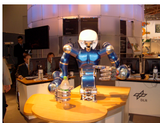
Figure 1: Justin upper-body robot: A 3-dof torso with two 7-dof arms

The Justin upper-body robot by DLR (Fig. 1) is made of a 3-dof torso (with coordinates \mathbf{q}_T \in \mathbb{R}^3 ), carrying two identical 7-dof structures as left ( \mathbf{q}_L \in \mathbb{R}^7 ) and right ( \mathbf{q}_R \in \mathbb{R}^7 ) arms. Neglecting the anthropomorphic hands, there is a total of 17 joints (all revolute), with \mathbf{q} = (\mathbf{q}_T^T \mathbf{q}_L^T \mathbf{q}_R^T)^T \in \mathbb{R}^{17} . Let the desired Cartesian motion (in position and orientation) of the end-effectors of the left and right robot arms be independently specified as \mathbf{r}_{L,d}(t) \in \mathbb{R}^6 and \mathbf{r}_{R,d}(t) \in \mathbb{R}^6 , respectively.